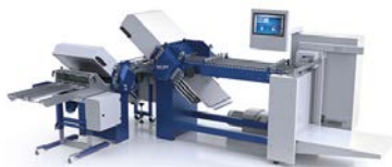
The new H+H S45, suitable for the production of short folded products.