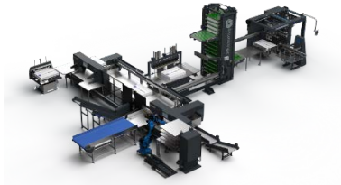
baumannperfecta – fully automatic jogging and cutting line for pharmaceutical application (similar image).