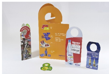
All In – die-cutting solutions with Swiss precision, BOGRAMA presents the versatility of its rotary die-cutting machine.